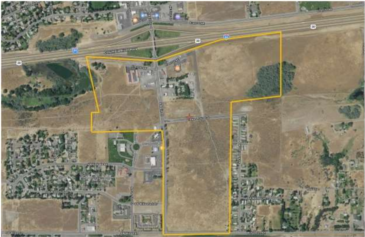
Boardman Central Urban Renewal Satellite Map 2017